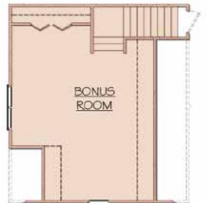
OPT. "B" BONUS w/ DORMER 396 SQ. FT. BONUS