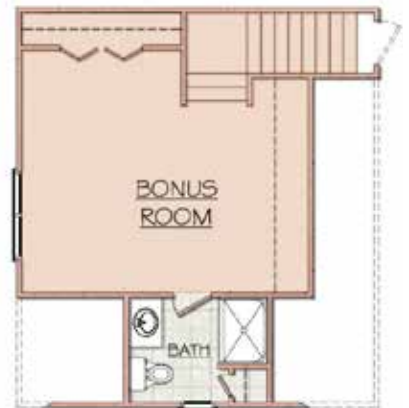
OPT. "C" BONUS w/ BATH 369 SQ. FT. BONUS